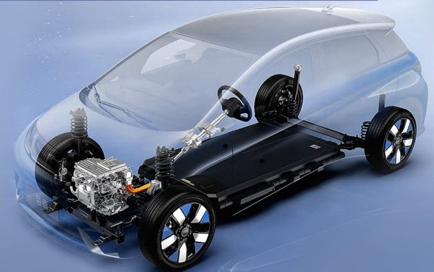
CUTTING EDGE TECHNOLOGY